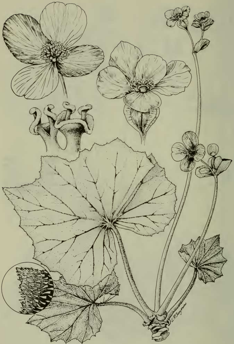
Begonia xerophyta L. B. Smith & Wasshausen